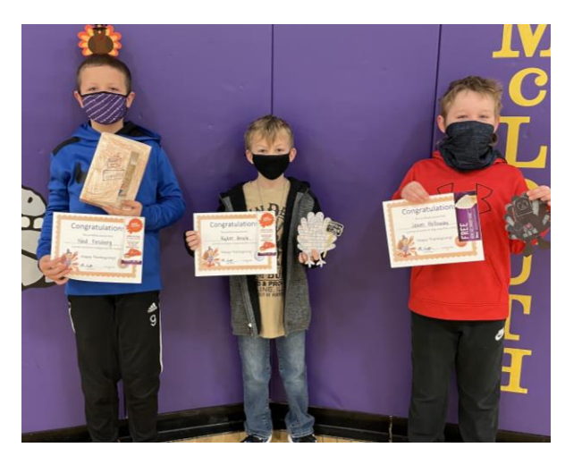
Turkey Contest : Congrats to our winners of the elementary turkey drawing contest. Thanks to Sonic and Caseys for providing prizes.